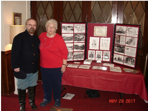
Mt. Salem Church Outreach Display