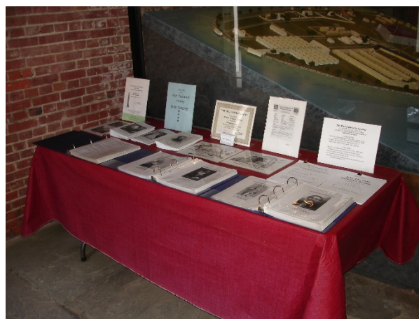
Heritage Research Display