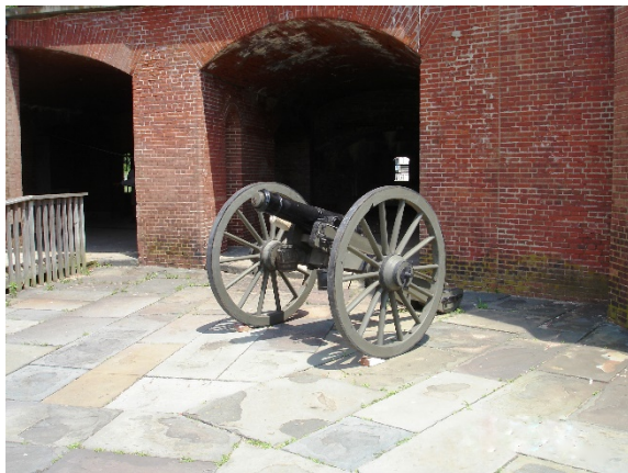
Field Gun No. 1