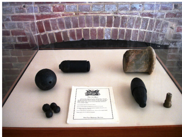
Artillery Shells & Fuses