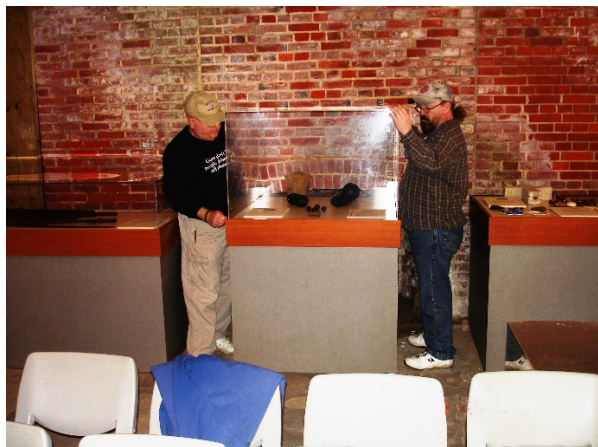
Replacing Museum Case Cover