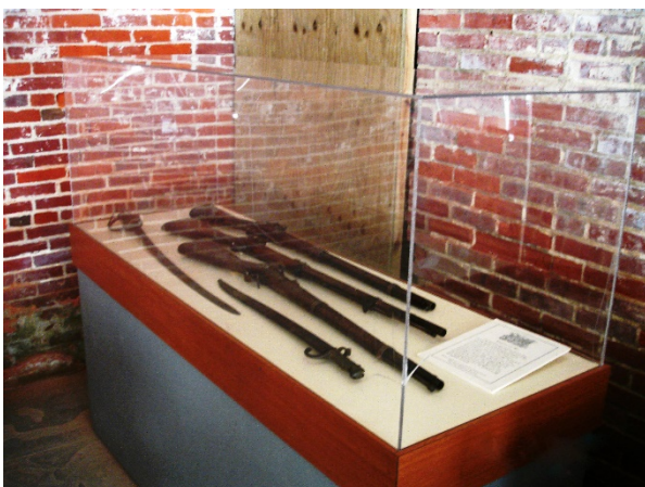
Rifles & Swords