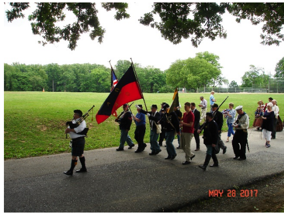
Marching to DuPont Memorial