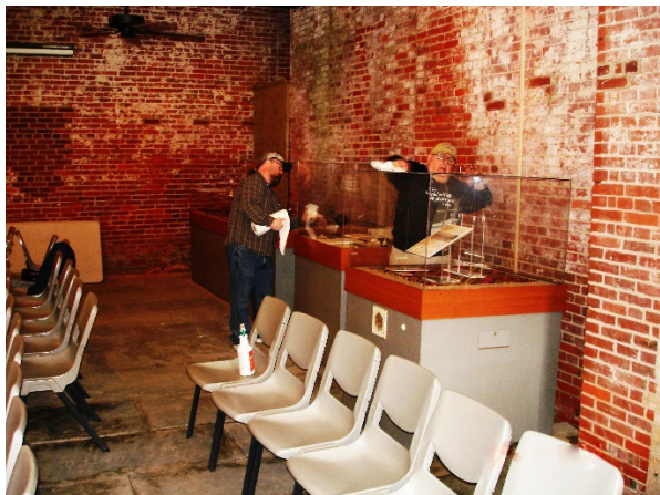
Cleaning Museum Cases