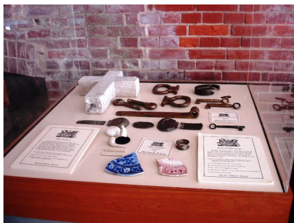
Chapel Cross, Door Keys & Hardware