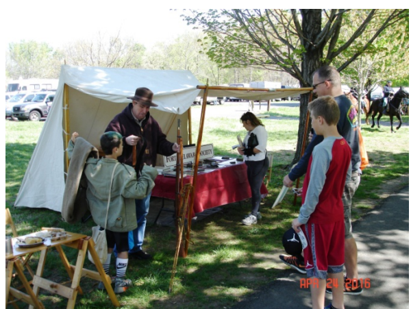
Society Outreach at Neshaminy