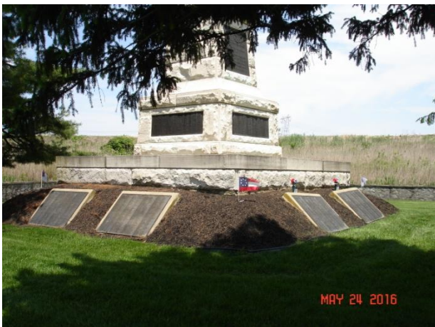
Confederate Monument at Finns Point