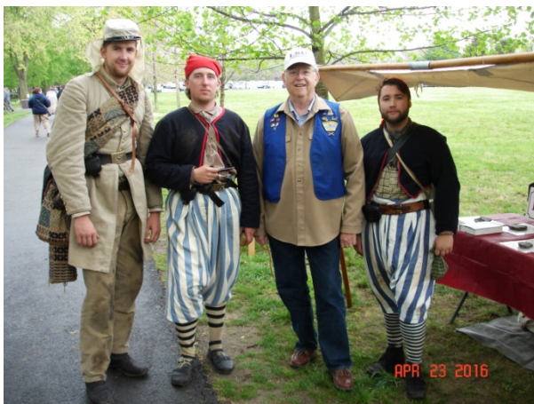
The Louisiana Tigers at Neshaminy