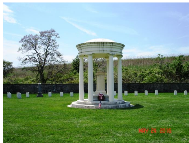
Union Monument at Finns Point