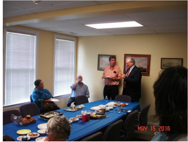
Spring Membership Meeting